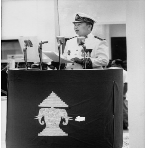
Gen. Phoumi Nosavan, leader of the Forces Armées Laotiennes. The U.S. attempt to simultaneously promote a neutral government and a strong army in Laos degenerated into a civil/military struggle for power.

arming and training of the FAL, now to be increased to 30,000, and develop an airlift and strike capability for its small air force. 63 This would mean an increased involvement of Air Force, CIA, and Army Special Forces personnel, but no deployment of combat troops.