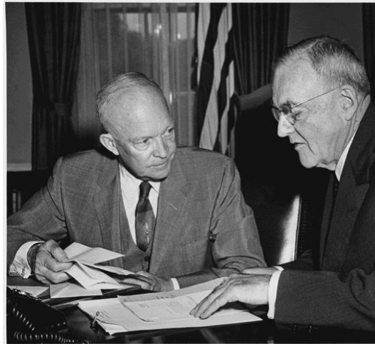
President Eisenhower and Secretary of State John Foster Dulles wielded U.S. nuclear supremacy to gain concessions from Moscow.

occurring in the strategic weapons balance with the Soviet Union, it utterly failed to take account of, let alone take advantage of, the Sino-Soviet split, or, indeed, of the French break with the United States in its policy toward Indochina. Worse, the failure of the administration to develop a counterinsurgency capability for its allies left it incapable of meeting challenges to Containment as they occurred. Indeed, these strategic omissions led to the failure of the administration's policy in Southeast Asia.