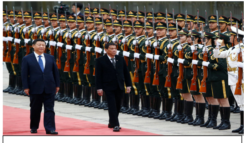
Xi presses China's advantage amid fraying Philippines-U.S. ties.

Does it matter that China, the rising power, expands its sway in the Far East? It does indeed. Little recognized in discussions about American power is the fact that the United States became a global hegemon in large part by linking its economy with the second-largest economy, thus dwarfing the next five economies combined. That economy, until 2009, was Japan, when China surged to second place. Would it matter if China succeeded in splitting the U.S.-Japan alliance? It would indeed. Aside from the geopolitical implications, the result would be a much smaller wealth, resource, and technology pool from which to draw. The United States could not afford to maintain a global hegemonic position. That role would have to be ceded to others. Japan is already exploring new security arrangements. The United States is at a critical moment and the question is: What is to be done?